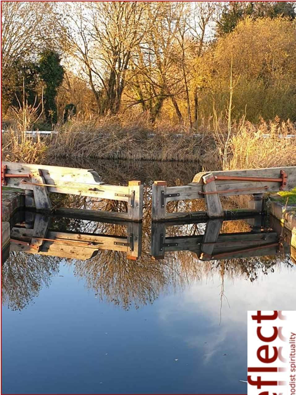
Cover picture at/ near Saul Junction, Gloucestershire Above—as above